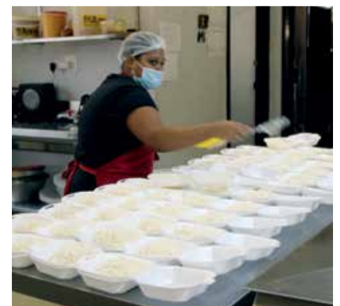
ABOVE: Service Dining Rooms feeds needy people daily.