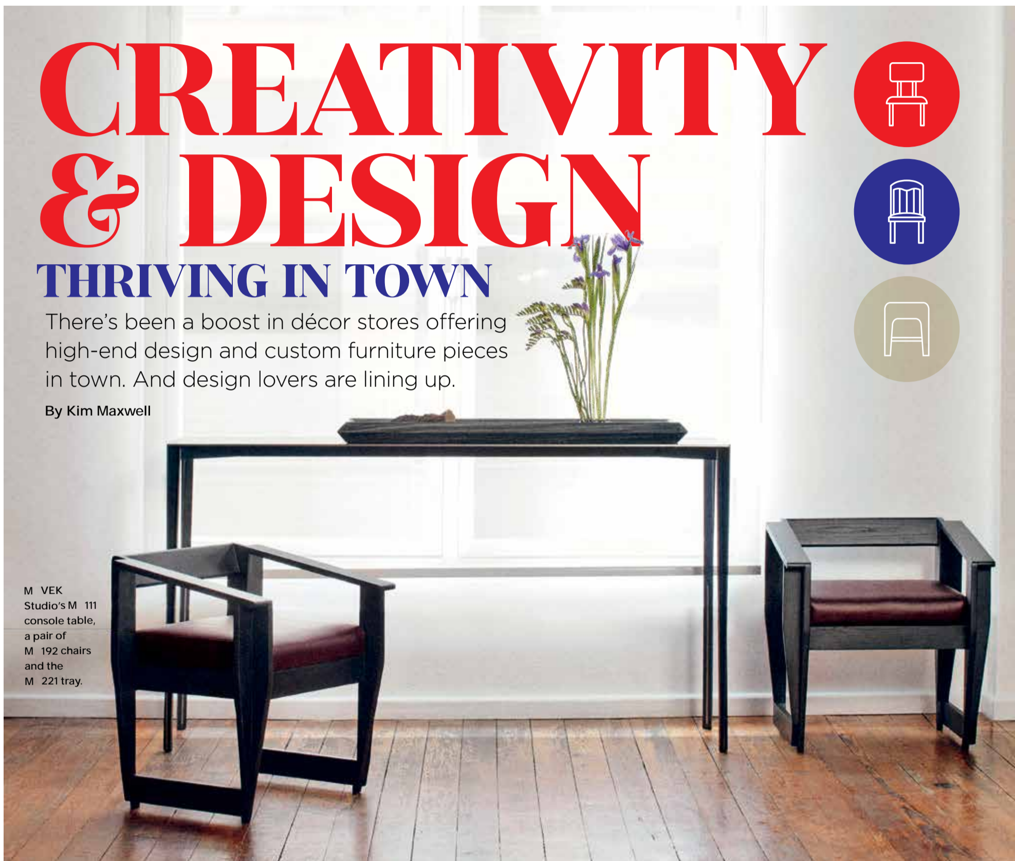
M VEK Studio's M 111 console table, a pair of M 192 chairs and the M 221 tray.