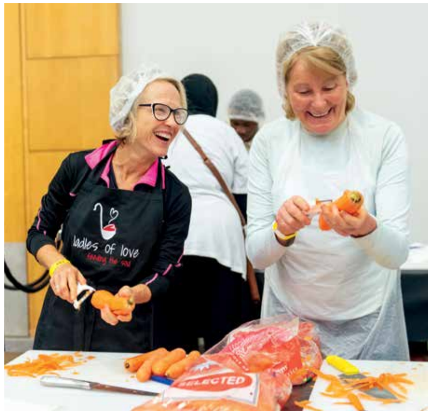
ABOVE: Volunteers at Ladles of Love's The Dignity Kitchen. ABOVE RIGHT: The Hope Exchange in Roeland St.

Cape Town NPO Ladles of Love runs The Dignity Kitchen, which operates four times a week at The Hope Exchange in Roeland St. Volunteers can assist with either chopping vegetables, cooking food or serving meals to homeless clients on the day and picking up waste after each serving. Since running a charity organisation is similar to running